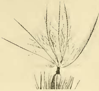
FIG. 1. DOWN FEATHER OF PTARMIGAN.